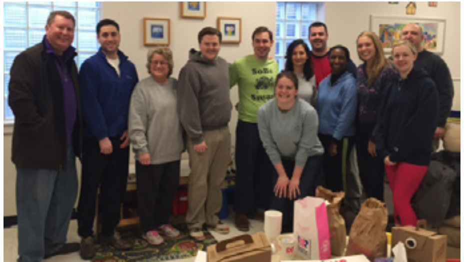
Montgomery County Young Lawyers volunteered at the Inter-Faith Housing Alliance on Dr. Martin Luther King Jr. Day of Service.