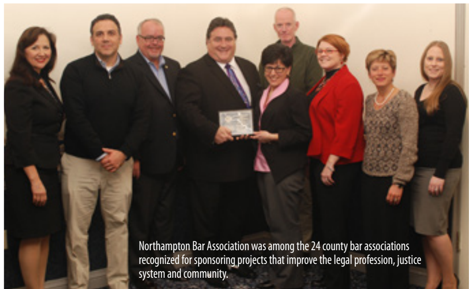
Northampton Bar Association was among the 24 county bar associations recognized for sponsoring projects that improve the legal profession, justice system and community.