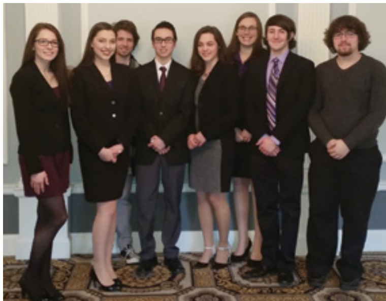
Congrats to McDowell High School of Erie, which represented the northeastern area of PA Mock Trial Finals.

Registration information is available at: eriebar.com . Participants who pre-register by April 15 are guaranteed a Law Day 5K race shirt.